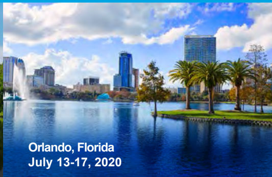
Orlando, Florida July 13-17, 2020