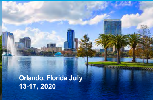
Orlando, Florida July 13-17, 2020