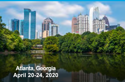
Atlanta, Georgia April 20-24, 2020